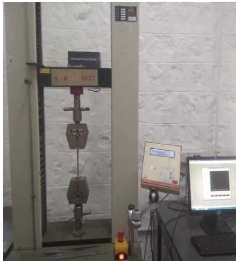
Figure 3 Tensile testing

The test measures important mechanical properties such as tensile strength, yield strength, elongation, and Young's modulus. As the load increases, the material undergoes deformation, and the corresponding stress-strain relationship is recorded. Tensile testing helps in evaluating the strength and ductility of materials, making it essential for analyzing the performance of composites like jute fibre-reinforced materials.