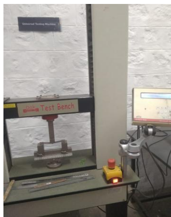
Fig.4 Flexural testing

Flexural testing is especially important for composite materials like jute fibre composites, as it helps assess their performance under bending conditions commonly encountered in real-life applications.