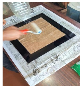
Figure 2 Fabrication using Hand Lay-up .